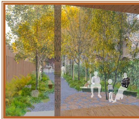
Landscape concept sketch of the front entrance to the proposed Emil Biorn Memorial Park & Museum at 2618 N. Albany, Chicago, IL