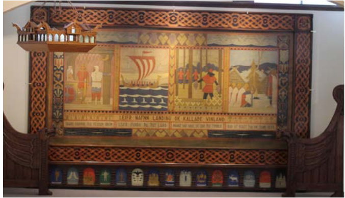
The head table bench and mural, with a chandelier from the Norske Klub. Now at Vesterheim in Iowa.