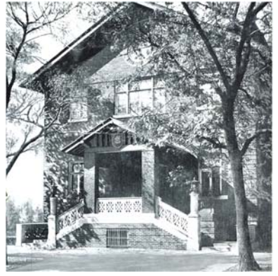
Our first meeting place at the Norske Klub on Kedzie Ave. in Chicago

We measure Scandinavian history in millennia, American history in centuries, and our Chicago Torske Klub in decades. We'll close this torsk season with some photos and memories of those days; our history in pictures.