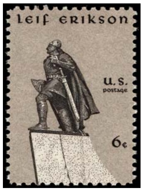
US Stamp commemoration of Leif Erikson

tual contributions of these Reformations. We will conclude with some Reformation answers to some