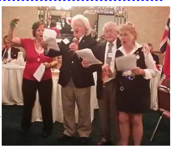
Santa's Assistants lead the Torske Klub in Christmas song in 2015

Bring your friends or relatives to the Torske Klub to share the warmth of this festive occasion. The reservation line is open. Call early for you and your guests!