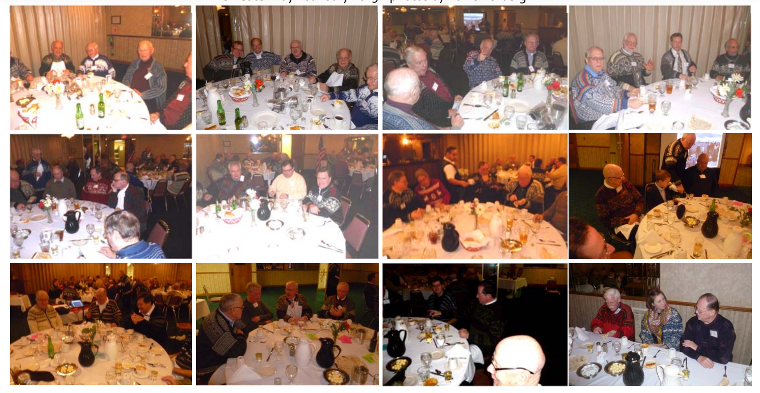
Christmas Celebration