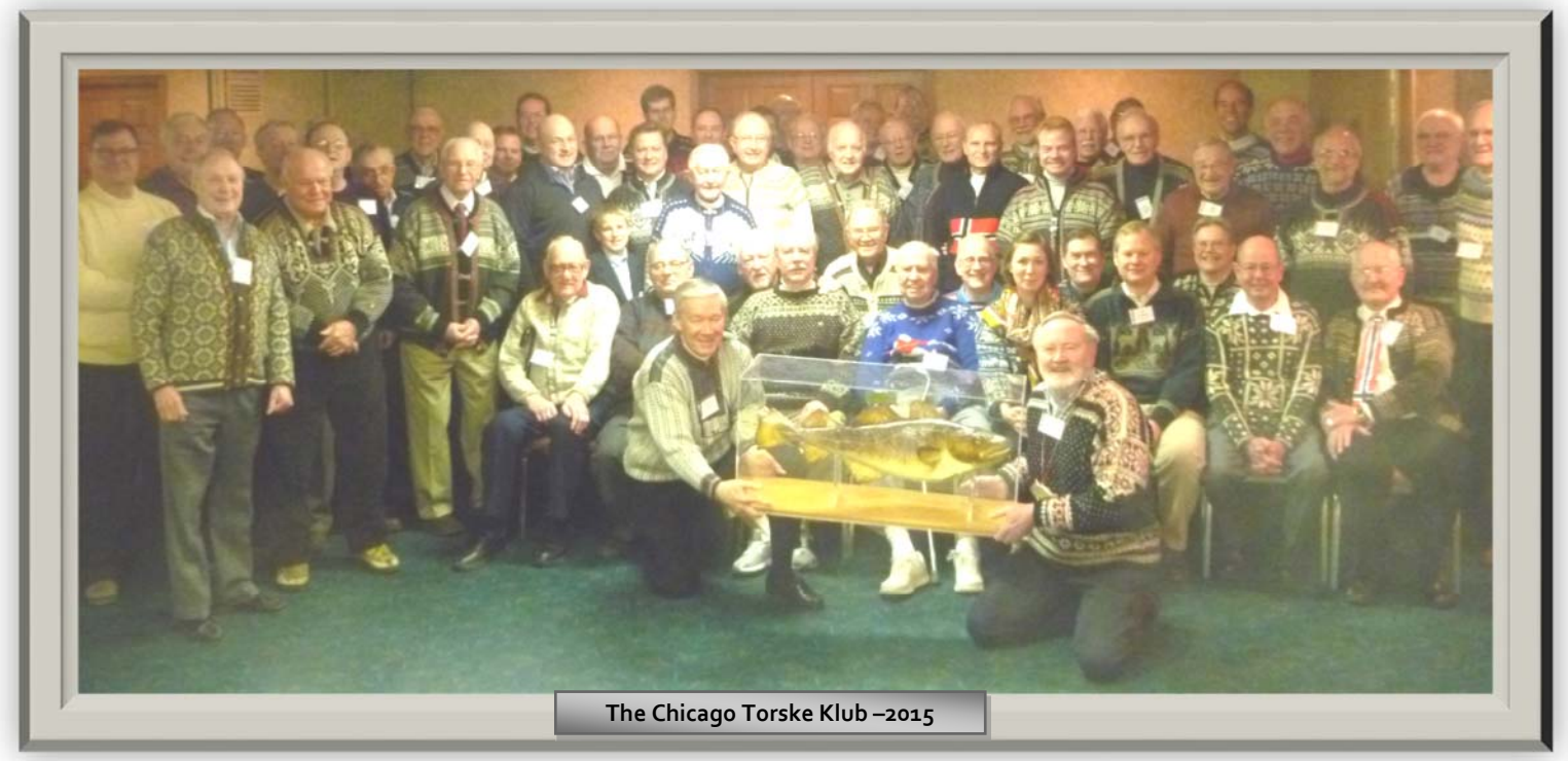
Sweater Day—January 2015