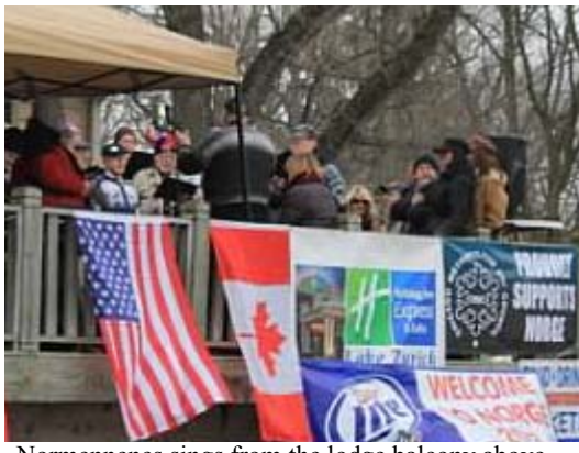
Normennenes sings from the lodge balcony above.

gian jumpers in the photo below. Sorry if we missed acknowledging you in the crowd of hundreds that attended. We'll catch 4 Norwegian ski jumpers stop for a photo below. you next time.