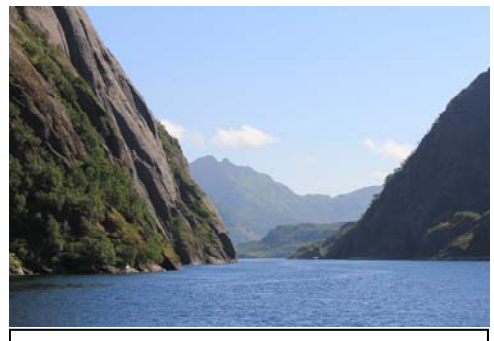
Trollfjord in Lofoten Islands Norway

Also see http://www.torskeklub.org for more and updated information.