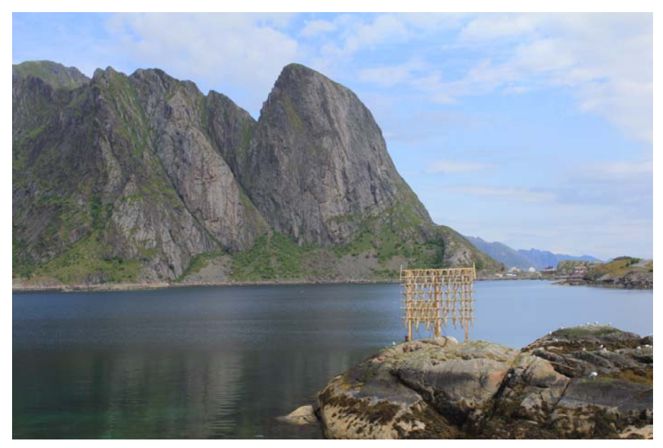
Lofoten Islands near Henningsvær

Happy birthday to all of our good members, and skål.