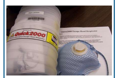
Bio-Chemical Escape Respirator issued to workers on Capitol Hill.